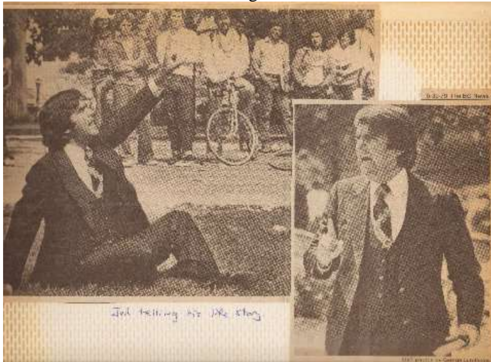
Bowling Green State University 1979

witness. He said the he hoped to be able to meet with me tomorrow to talk more. Perhaps we will be able to work something out.